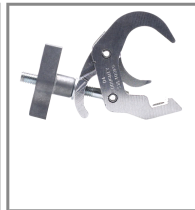
Quick-trigger clamp Ø38.1- 51mm P/N: 91602007