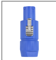
PowerCon NAC3FCA Power Input Connector P/N: 05342804