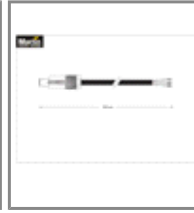
3m pwr.cable w.PwrCon NAC3FCA, AWG12 SJT P/N: 11541503