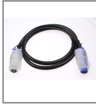
1.4m PowerCon power relay cable AWG 12 S P/N: 11850099