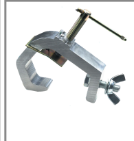
G-Clamp P/N: 91602003