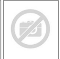
MAC Aura Pixel board Kit P/N: 50400735