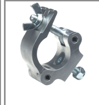
Half-coupler clamp for Ø50 P/N: 91602005