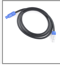
2.25m PowerCon power relay cable AWG 12 P/N: 11850100