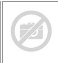
SAFETY CABLE, 60KG, BGV C1 P/N: 91604006